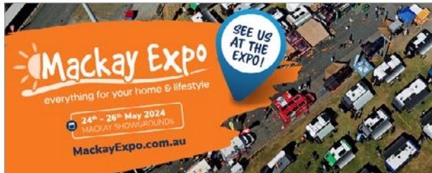
Email Signature 1