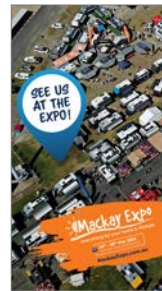
Social Media Story