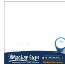
Social Media Post Template 2