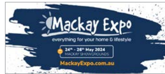
Facebook Cover 4