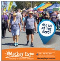
Social Media Post 2