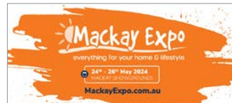
Facebook Cover 2