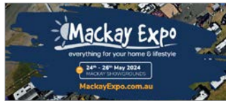
Facebook Cover 3