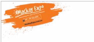
Facebook Cover Template 1