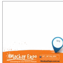
Social Media Post Template 1