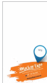
Social Media Story Template