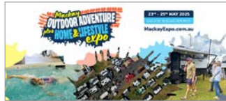
Facebook Cover 1