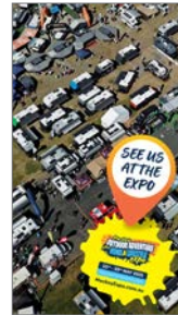
Social Media Story