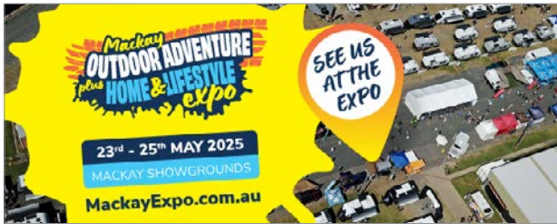
Email Signature 1