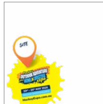
Social Media Post Template 1