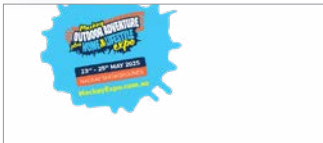
Facebook Cover Template 1