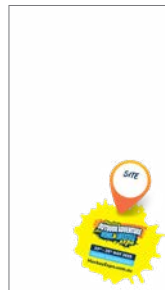
Social Media Story Template