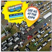
Social Media Post 1