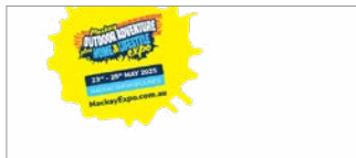
Facebook Cover Template 2