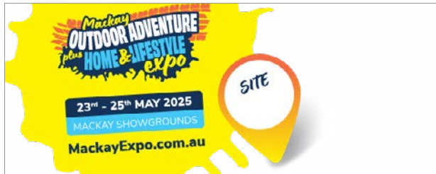
Email Signature Template 1