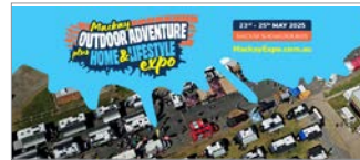
Facebook Cover 2