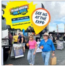
Social Media Post 2